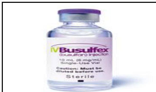
Figure 1: Busulfex

required for parenteral administration. The intravenous (IV) formulation was initially commercially available on the US market as Busulfex. It is a clear, colorless concentrated solution of 6 mg/mL in ampoules; the Busulfan is dissolved in N,N-dimethylacetamide (DMA) 33% w/w and polyethylene glycol (PEG) 400 67% w/w, using the principle of co-solvency.