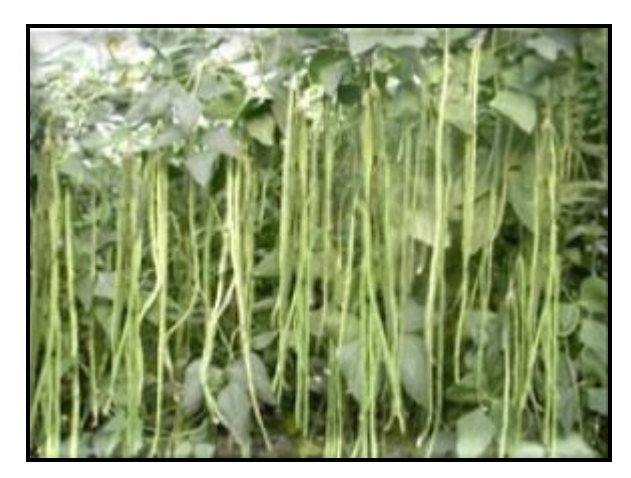
Figure 1: Vigna Unguiculata